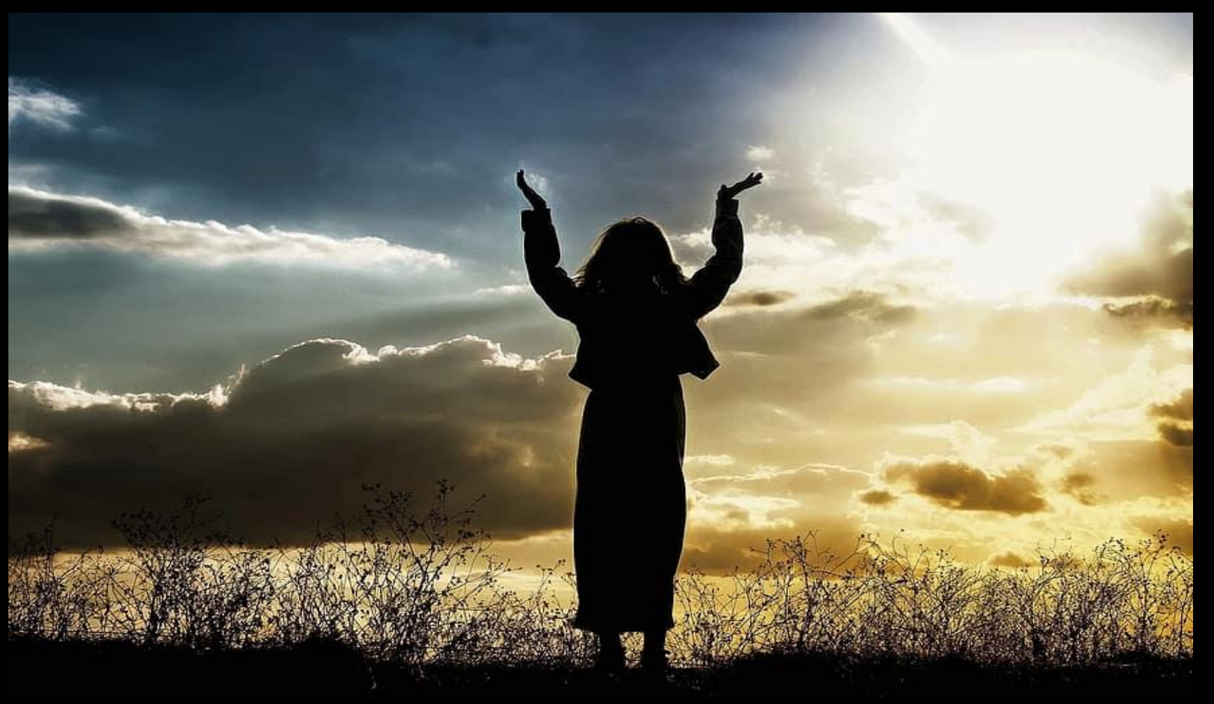
Written by Elaine Bidgood Sveet; Gathering, Lent-Easter; 2025, Page 37; Used with permission