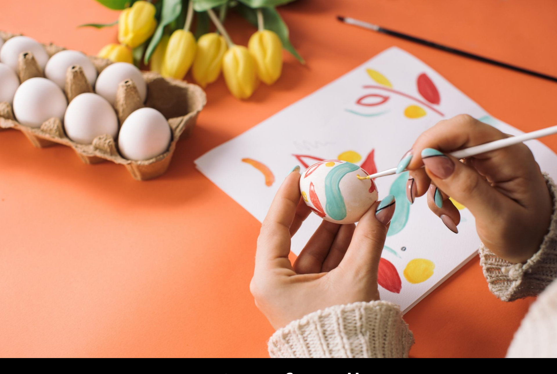
Story Time for all ages