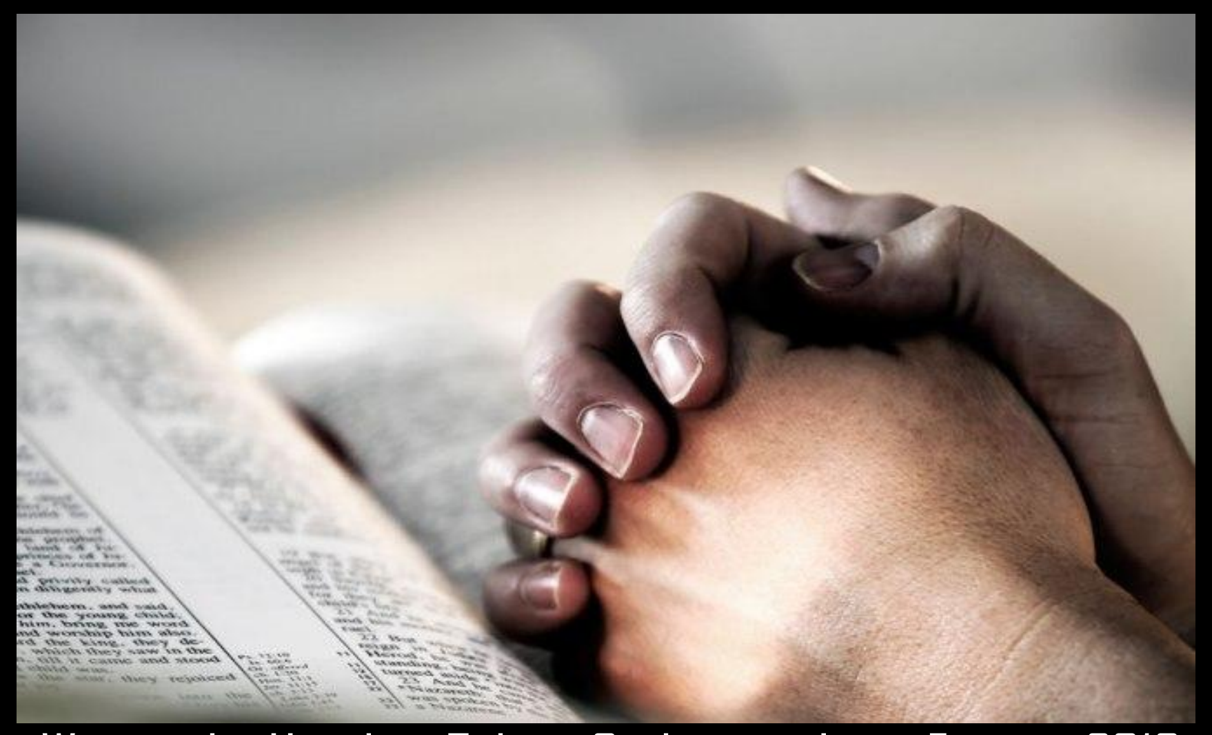
Written by Heather Tober; Gathering, Lent-Easter; 2019, Page 33; Used with permission